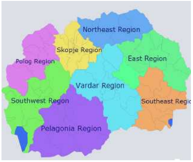
Figure 1: Planning regions

Geographic distribution per country development region . The country is divided into eight regions, with different levels of development. These regional divisions are shown in Figure 1 below.